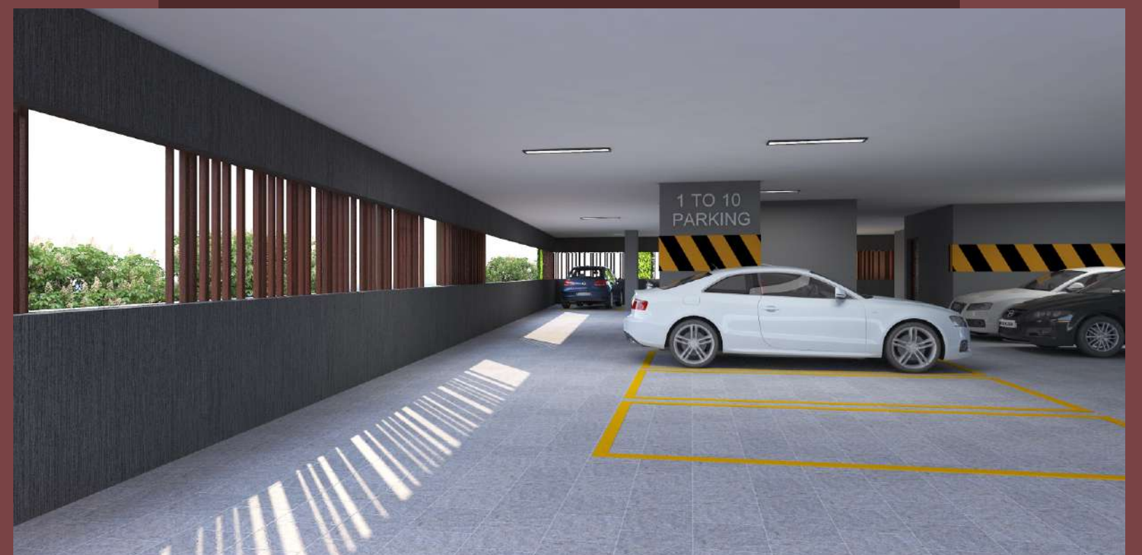
3 Level Surface Podium Car Parking

Experience entertainment & leisure... sports & fitness rejuvenation & wellness. Thoughtful amenities designed to help you live every moment to fullest.